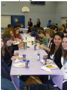
Pancake breakfast at St. Joseph's High School

The event was a big success and raised over $3,200 in support of our programs and services.