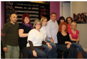
Hair Junkies staff

In addition to the stylish cuts given at both salons, there was a 50/50 draw, silent auction items, prize draws, a barbecue, and sandwiches and fruit trays.