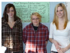
Winning artists for poster competition