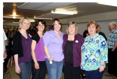
Promoting awareness at bean supper and euchre night