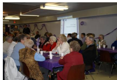
Bean supper attendees