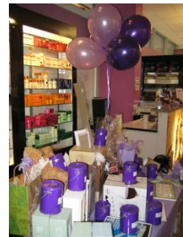
Prizes at Hair Junkies