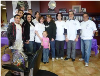
Elite Image staff

Our 4 th Annual "Scissors for Seizures" fundraising event was held on Sunday, April 5, 2009 at Elite Image Hair and Spa and at Hair Junkies on Laurier Avenue.